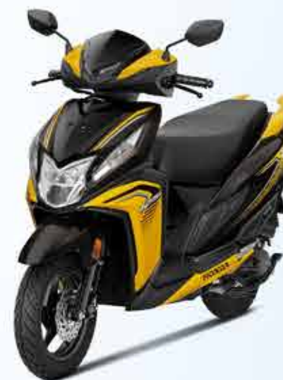
PEARL SPORTS YELLOW